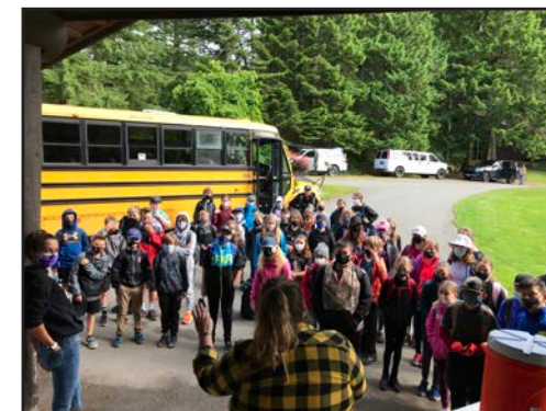
Our First Guests In 448 Days