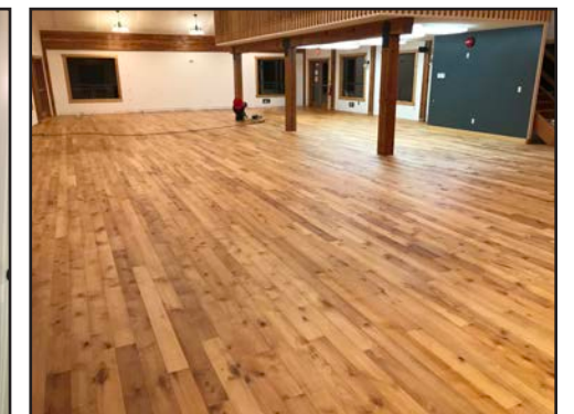
Lodge Dining Room Floor Refinishing